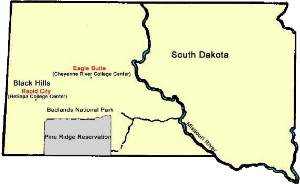
Pine Ridge Indian Reservation (Oglala Lakota, Bennett and part of Jackson Counties, SD)